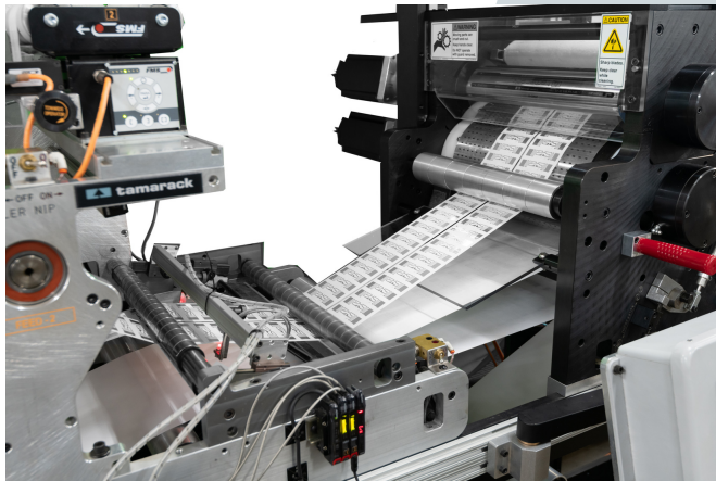
Dry Inlay Insertion

The most productive method in the world. Print, insert, and finish your RFID products in one pass, multi-lane, at high production speeds