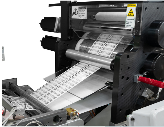
Dry Inlay Insertion