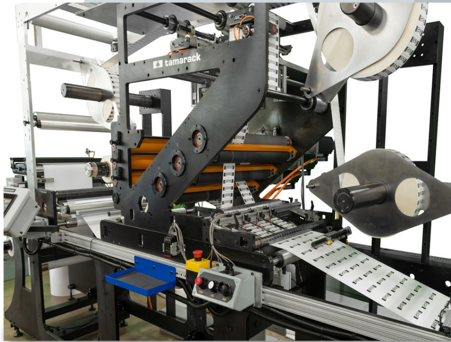
Wet Inlay Insertion

Tamarack has a solution for every RFID insertion process: