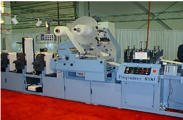
The Tamarack P500 in-line on a Propheteer press, applying transfer tape to produce integral labels.

How it works. The form is printed on the flexo press and routed to the Tamarack P500. The P500 applies a patch of transfer tape or adhesive-coated liner to the form. The form is then turned over and die-cut in the area of the patch, using the press die cut station, to produce the integral label.