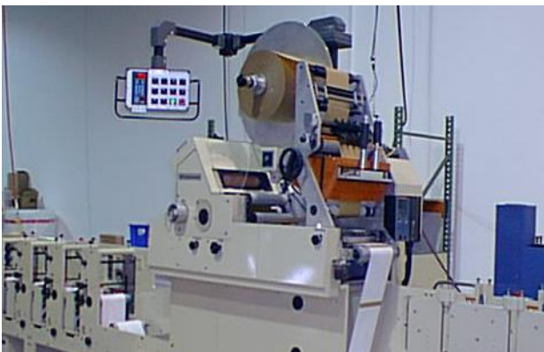
The P500 on a Mark Andy 2200 press, applying liner coated in-line with hot melt pressure-sensitive adhesive (the hot melt coating head is located behind the orange guarding).

Inline advantages. Most integral labels are produced offline. By choosing an inline production system, you reduce your initial equipment investment by using your press' infeed, delivery, and die-cut station AND you eliminate the additional step of offline web finishing.